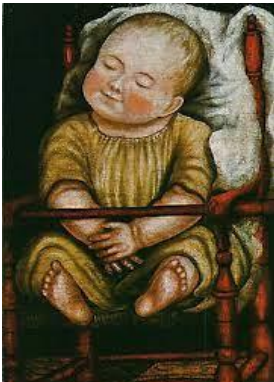
Baby in a Red Chair 1810-30 unknown artist.